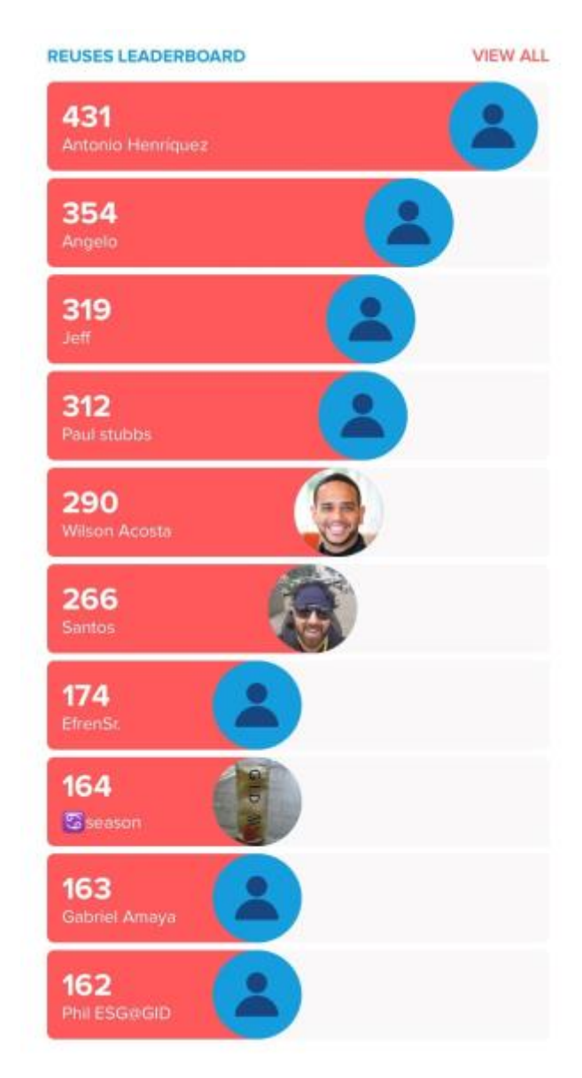
3 - Current Leader Board