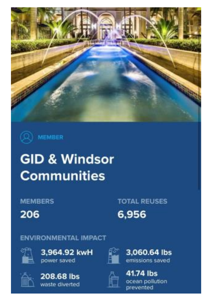
4 - Impact So Far

In June 2021, GID and Windsor partnered with Fill It Forward to bring all employees a "smart" water bottle. These bottles allow everyone who has downloaded the Fill It Forward app to track their environmental footprint from reuse and also our collective impact. We would like to thank all those who have downloaded the app and been participating in the group. We challenge you, if you have not done so already, to download the Fill It Forward app, stay hydrated and support our ESG efforts.